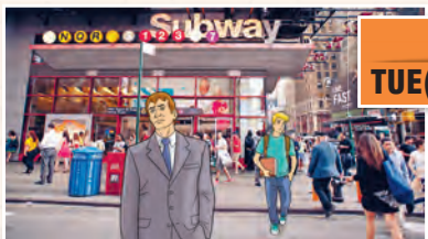
Tuesday TUE(S) or Tue(s).