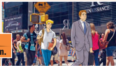
Monday MON or Mon.