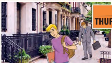
Thursday THUR(S) or Thur(s).