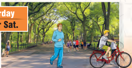
Saturday SAT or Sat.