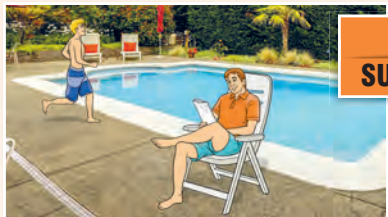
Sunday SUN or Sun.