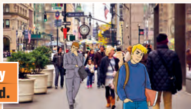
Wednesday WED or Wed.