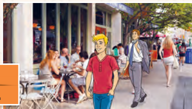
Friday FRI or Fri.