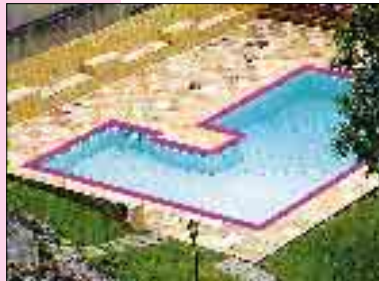
swimming pool or pool