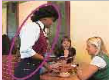
waitress (plural: waitresses)