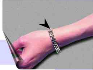
SHE'S WEARING A BRACELET.