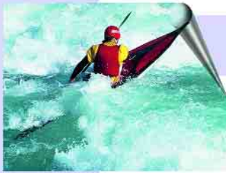
SHE'S IN A KAYAK.