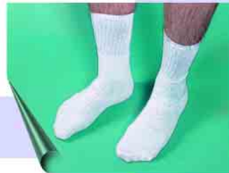
A PAIR OF SOCKS