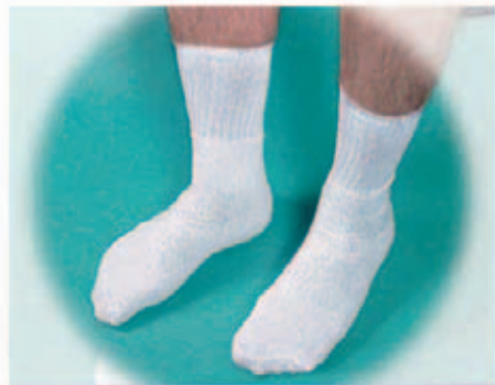
A PAIR OF SOCKS