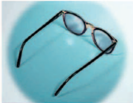
EYEGASSES OR GLASSES