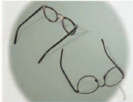
THESE FRAMES ARE NICE.